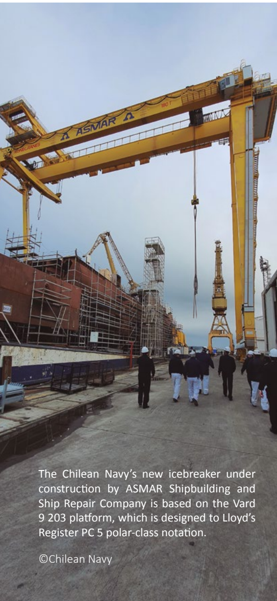
The Chilean Navy's new icebreaker under construction by ASMAR Shipbuilding and Ship Repair Company is based on the Vard 9 203 platform, which is designed to Lloyd's Register PC 5 polar-class notation.