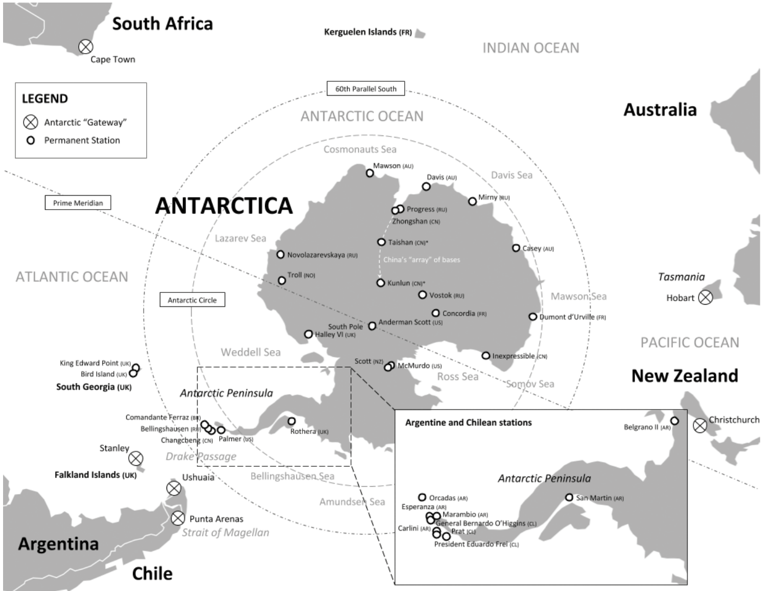
Map 1 | The map is a geographical approximation produced using the World Map Generator ( http://www.worldmapgenerator.com/en/daVinci ) and the Miller Projection, centred on the South Pole. As such, the base map is proportional, and to scale, but the upper layers are added by the researchers. These are approximations, but at the scale of A4, should not confuse or mislead the reader.